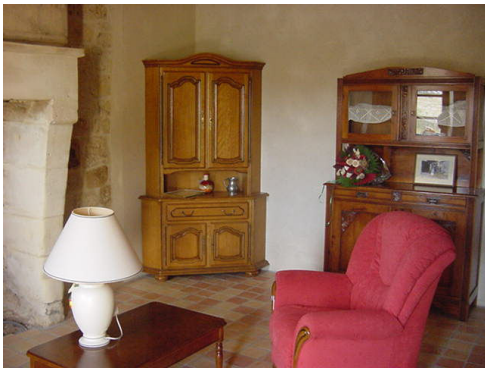
Fire place, Tv, telephone (incoming calls and emergency calls only)