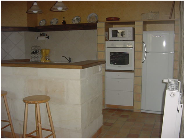
Kitchen with cooking facilities :

Microwave, electric oven, fridge, dishwasher, hotplate, extractor hood.