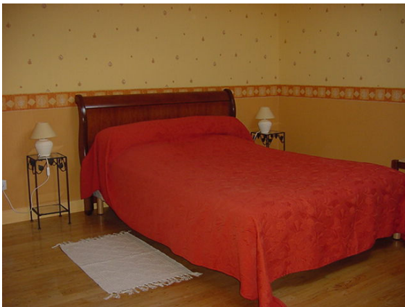
1 king size bed and one single bed per bedroom. Baby equipement also available.